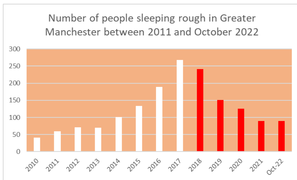
Graph 2: Rough Sleeping single night snapshot figures 2010-2022, note the 2022 figure has been taken from October, prior to the November national count date.

3.3. In response to this the Mayor of Greater Manchester is able to commit additional funding into A Bed Every Night this winter (£460,000) on a non-recurrent basis, from the Mayoral budget within current resources.